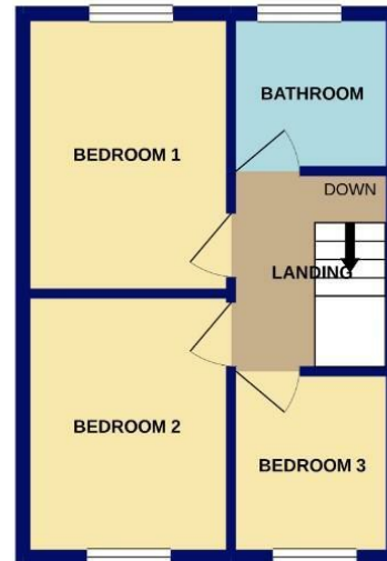
1ST FLOOR 28.8 sq.m. (310 sq.ft.) approx.